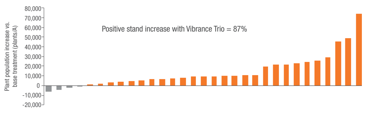
14 – 21 days after planting Syngenta field trials (n = 31); 2015 – 2017, trial locations: OK, IA, GA, OH, AL, AR, LA, NC, IN, TN, TX, MS Trials reflect treatment rates and mixing partners commonly recommended in the marketplace.

Vibrance Trio consistently enhances early-season soybean health, increasing the odds of higher yields and more profitable crops. It helps you avoid replanting – saving both time and money – by providing a stand increase 87 percent of the time compared to a check treatment.