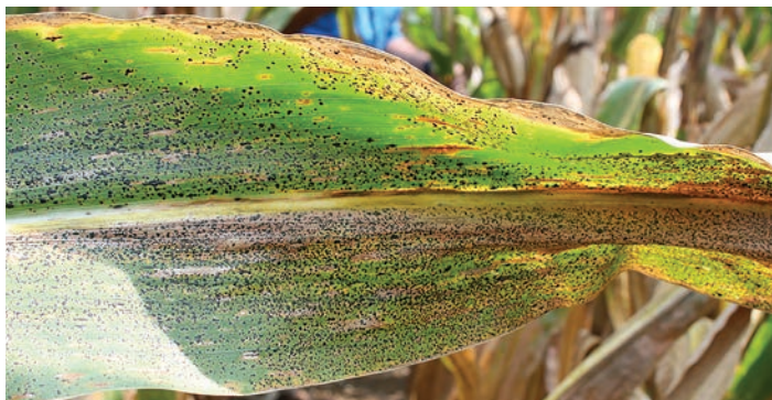
A corn plant infected with tar spot at the Mt. Joy, Pennsylvania; Grow More™ Experience site; 2021

Three-way premium products, like Miravis® Neo or Trivapro® fungicides, preserve more yield under tar spot pressure than two-way or solo fungicide products. Why? Miravis Neo and Trivapro contain ADEPIDYN® and SOLATENOL® technology. That means they stay active for significantly longer periods of time to protect yield against disease and environmental stresses.