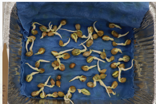
Trebuset Peanuts 2 oz / 100 lbs seed