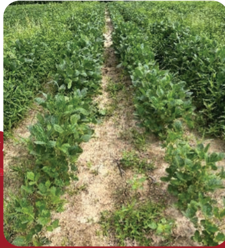
Zidua® PRO 4.5 fl. oz/A