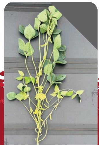
Competitor 15 nodes

R3 stage node counts: Tendovo – 16 nodes; CruiserMaxx APX + Salstro + Tendovo – 18 nodes; competitor programs – 14-15 nodes.