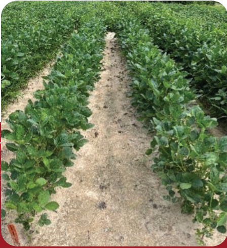
Tendovo® 1.6 qt/A