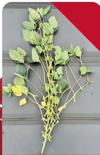
CruiserMaxx® APX, Salstro, Tendovo 2.1 qt/A 18 nodes