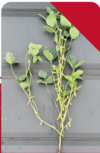
Tendovo 2.1 qt/A 16 nodes

Healthy beans don't waste energy fighting stress—they put it toward building yield. When weeds are shaded out early, every node works harder. More nodes mean more pods, and more pods mean the profit you expect and the yield you planned for.