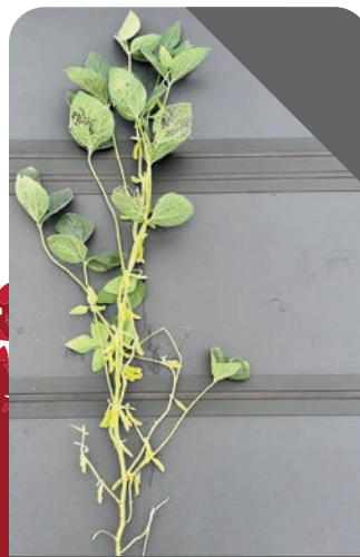
Competitor 14 nodes