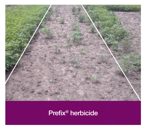
Syngenta trials, 2018; Morgan, Minnesota.