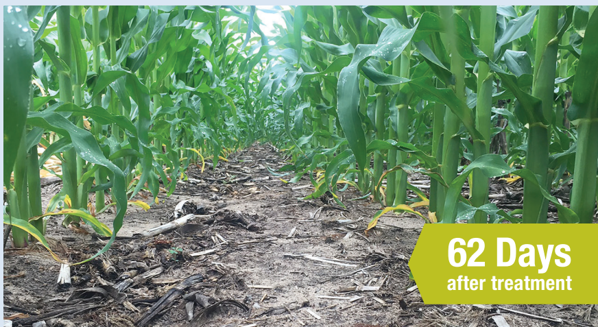
Acuron Flexi 2.25 qt/A – Muscoda, WI

Acuron Flexi delivers improved broad-spectrum control of many broadleaf weeds and annual grasses in corn, including giant ragweed, Palmer amaranth and waterhemp.