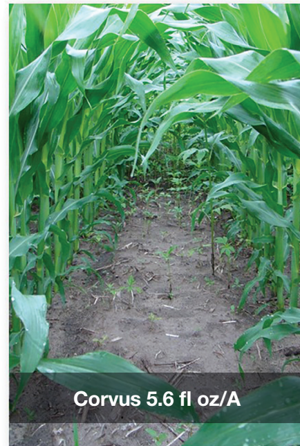
Corvus 5.6 fl oz/A

Learn more about Acuron Flexi at SyngentaUS.com/AcuronFlexi or talk to your local Syngenta retailer. Join the conversation on social media using #ToughWeeds .