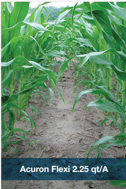
Acuron Flexi 2.25 qt/A