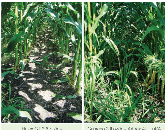
Halex GT 3.6 pt/A + AAtrex 4L 1 pt/A