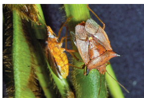
Brown Stink Bug