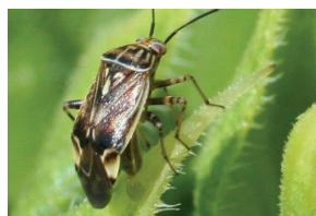
Tarnished Plant Bug*