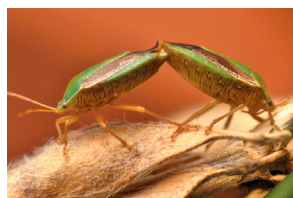
Green Stink Bug